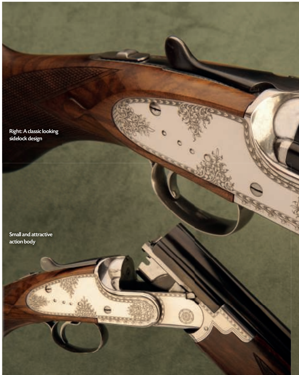
Right: A classic looking sidelock design

The manufacture of the barrels does however require some hand work in the form of exterior finishing but it's not the laborious task required of more conventional manufacturing methods. Longthorne's own 70mm flush fitting choke tubes come as a no cost option and the London Proof House passes the barrels for 3" high performance steel ammunition. On that basis its do anything go anywhere capability adds another dimension to this very different kind of game gun.